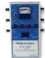
Model 480B21 3 Channel Battery Powered