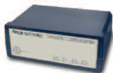
Model 482C05 4 Channel Line Powered