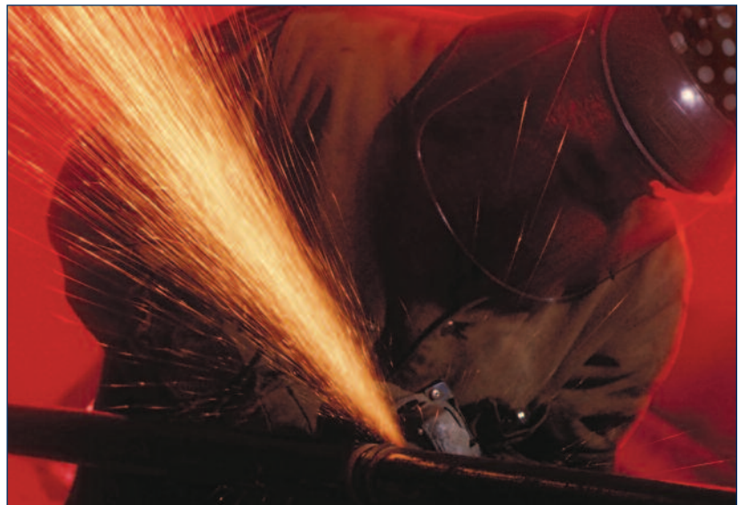
Tool maintenance and safe operating conditions can be monitored using HVM100